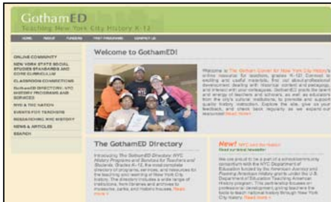
GothamEd provides online resources for New York City teachers and students.

Gotham connects people virtually with resources, events, and each other via our web site ( www.gothamcenter.org ) drawing over six million hits per year.