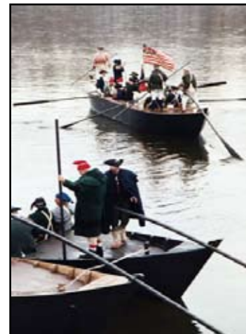
photo of Crossing Reenactment

For more information on the Washington Crossing Reenactment, go to www.ushistory.org/washingtoncrossing/